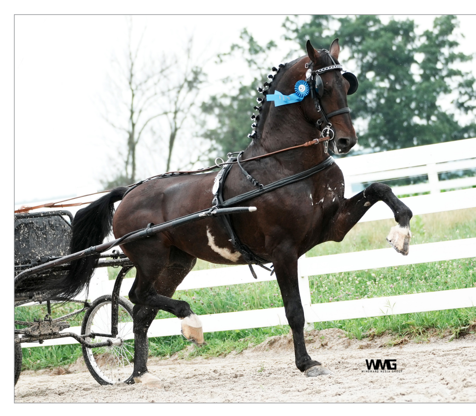
Globetrotter, 12 yr old Approved, sport stallion Champion test center, multiple champion KWPN-NA Fine harness cup. Multiple champion offspring!

We are pleased to presented these stallions activated with KWPN-NA for the 2023 breeding season.