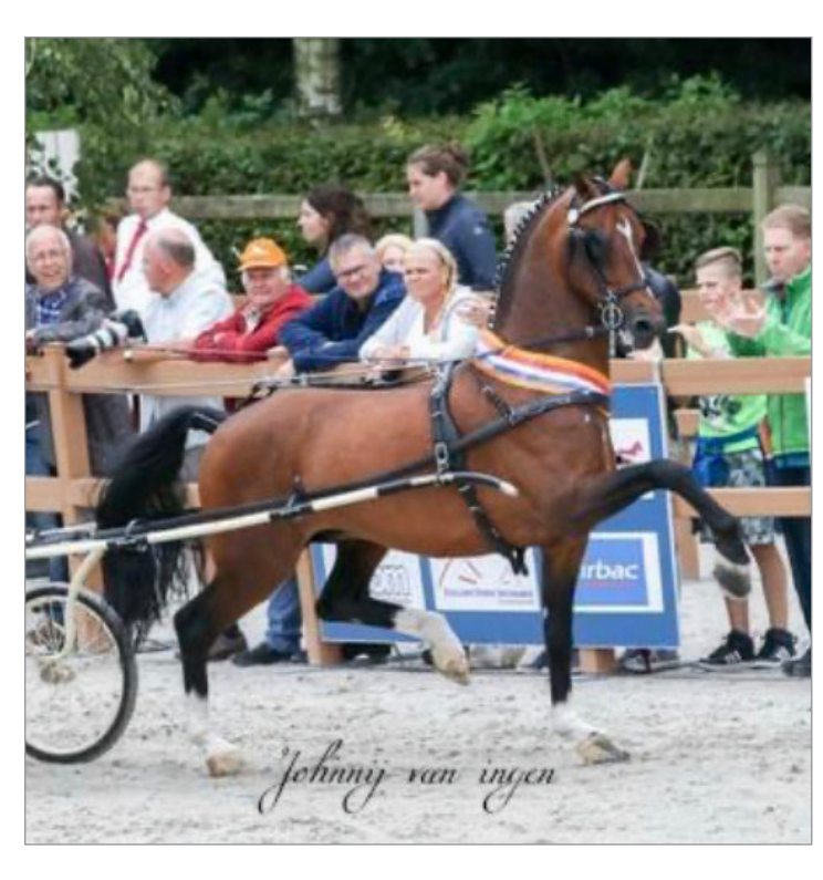
Atleet, 18 yr old Appoved, keur stallion. Winner of multiple prestigious awards! Multiple champion offspring, including several approved sons!