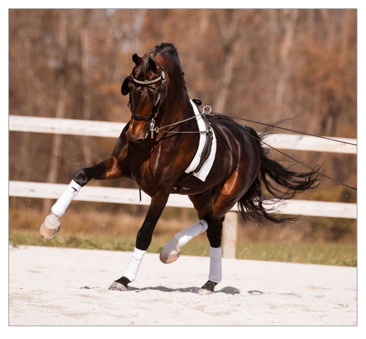
Jaleet, 9 yr old Licensed stallion. Champion IBOP. Offspring have good results at the keurings, including keuring champions!