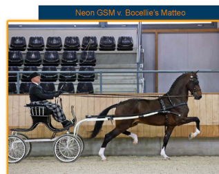
Neon GSM v. Bocelle's Matteo