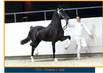
723 – Onana v. Idol

In total, 5 Harness Horse Stallions are selected for the KWPN performance test