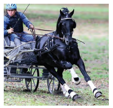
National Champion in Combined Driving