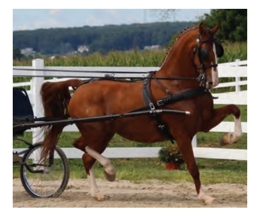
KWPN Keur Mare and Multi-Champion in Harness