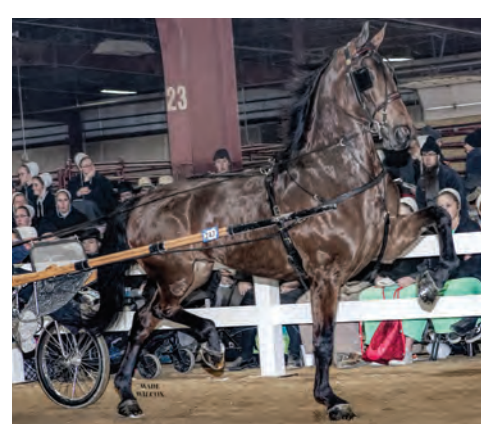
KWPN Keur Mare and Sale Highlight

Co-owned by Tri Spring Acres and Rocky Ridge Stables