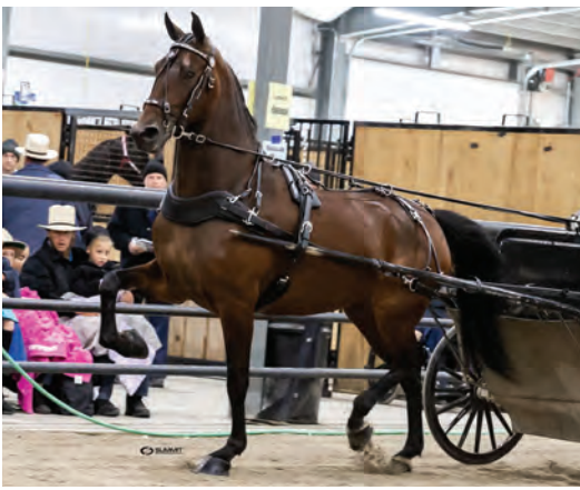
Sale highlight — Sold for $14,500 as buggy horse