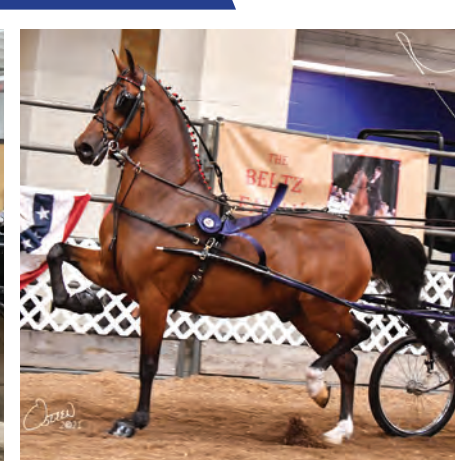
ADHHA National Champion