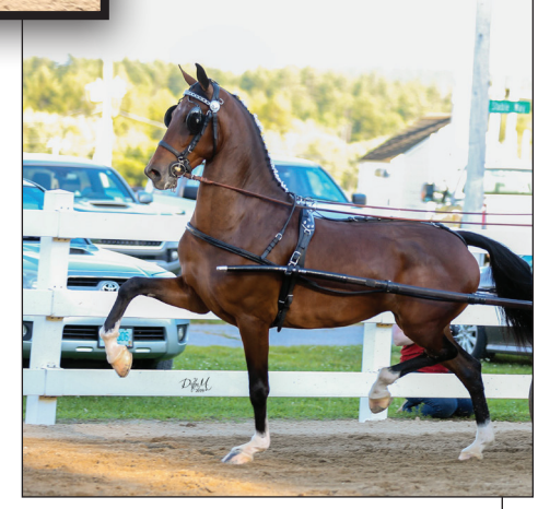
Prepped and presented by Rocky Ridge Stables

Bred, raised, prepped by Rocky Ridge stables, sold as a weanling for $36,000