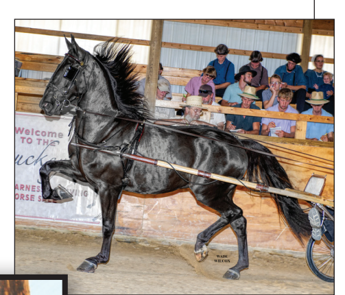
Prepped and presented by Rocky Ridge Stables