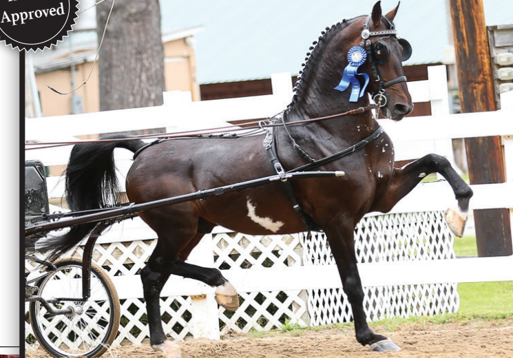
Prepped and presented by Rocky Ridge Stables