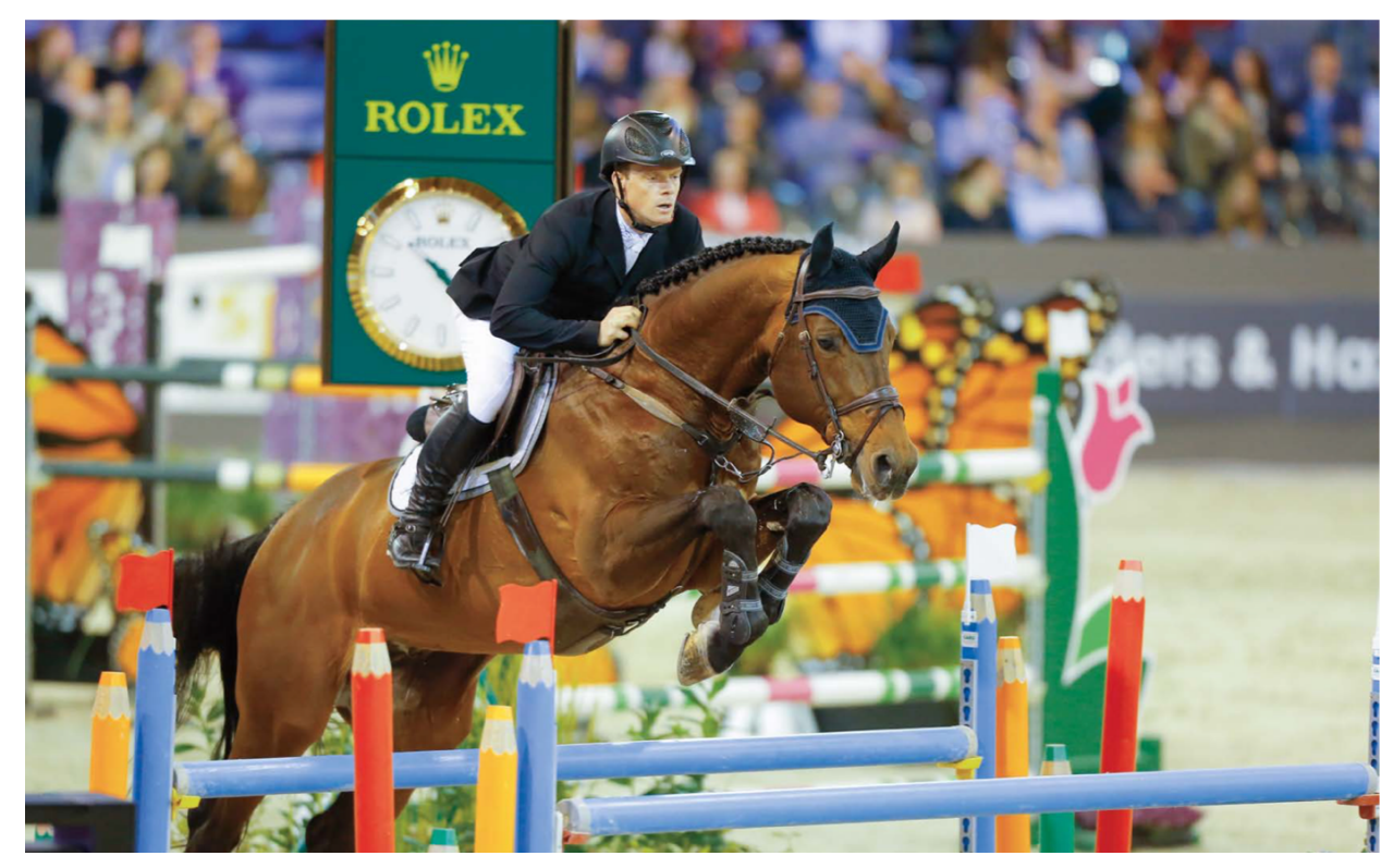
Despite the young age of his internationally performing KWPN offspring, Eldorado van de Zeshoek (by Clinton) is able to position himself firmly in the list of jumping stallions with high reliability.

Breeding values for dressage, jumping and conformation are also calculated for Gelders breeding. Although the principle is the same, these breeding values cannot be compared one on one with those of the riding horses. It is a separate population, in which the Gelders horse is more of a purebred than the riding horses. The characteristics of the Gelders horse go further than just dressage or jumping talent. Gelders breeding requires versatile, rideable horses that have a good exterior and a Gelders type. The conformation breeding values are a useful aid for the Gelders type, they can be found in the KWPN Database.