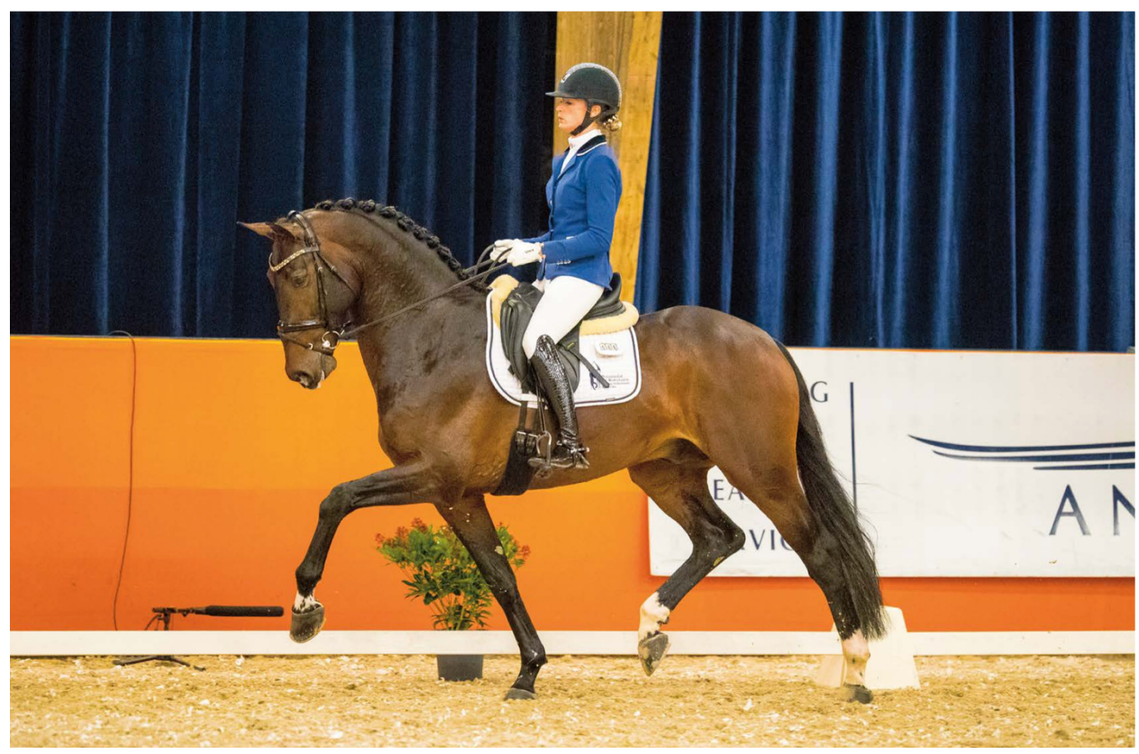
Joop TC (by Ravel) has, based on his own performance, the highest breeding value in combination with a low relationship and is therefore an interesting stallion for breeding.

It is not just the performance of the stallion himself and the offspring that is examined, the performance of his family is also included. Descent can play a role, especially with young stallions. If the sire of a young stallion increases in breeding value, this has a positive effect on the breeding value of the young stallion. This effect is later inherited by his offspring.