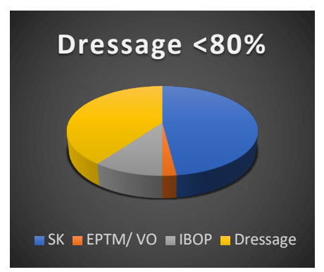
Figure 4: With a reliability lower than 80%, the data from the studbook inspections and sport form the largest share in the breeding values.

Dressage 49% EPTM / VO 4% IBOP 5% SK 42%