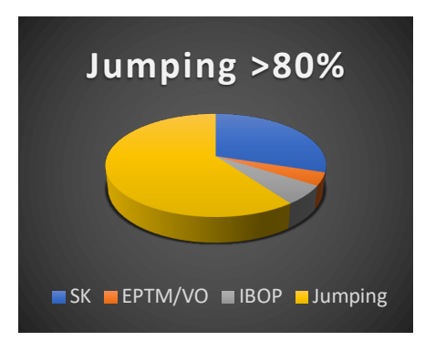
Figure 1<sup>1</sup>: Among the stallions with reliability higher than 80%, the data for the breeding value comes mostly from sports results (60%). The remaining share comes mainly from the studbook inspections (SK).