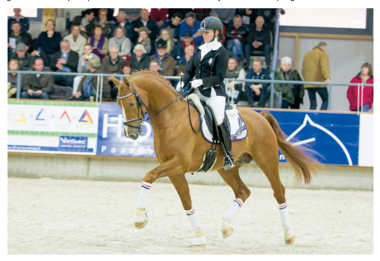
The conformation breeding values are a useful aid for the Gelders horse. The breeding values of Danser (v. Sander) can also be found in the KWPN Database.

"Breeding is an emotional matter that should be viewed from a practical point of view", is a frequently heard argument when it comes to (not) using the breeding values. A feeling for breeding, experience and vision are indeed the most important 'traits' of breeders. According to some breeders, a numerical foundation does not fit in with this. We think this requires some nuance. Breeding values are built up on data about all horses in the population. There are only a few breeders that can really attend all the possible events and are able to paint a similar detailed picture of the offspring of a stallion as the breeding values do. Everyone has the best performing offspring in mind, but breeding values concern all offspring. Also the less performing ones, because perhaps there are much more of those than is initially thought. That gives a more complete picture of the actual inheritance than just the best offspring.