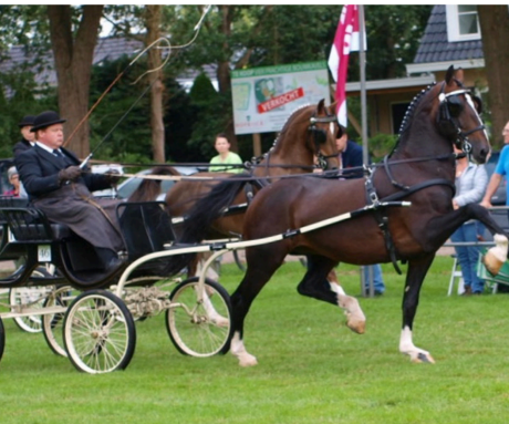
Urgent (Waterman x Ureterp x Marconi)

BART: "I am a great supporter of breeding values, so everyone can see what the qualities of a horse are. Without looking at color or phenotypic values."