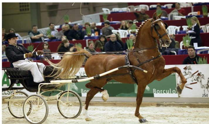
Marvel, half Saddlebred stallion by Immigrant

WIM: "In the Netherlands there are three stallions who pull the cart and really earn a living as a stallion. In the past, sometimes stallions were just approved because they had an attractive color, because that sells easily. But that has not progressed breeding either. I myself select very strictly, and if I then see such a couple of offspring of a stallion at the inspection, which have a nice color but not the desired qualities, then I think, the inspectors could ramp on the surveillance on that. A well-functioning hind leg is a very determining factor in every discipline, we should never give in to that. The bar could be raised with regard to stallion selection, but we will also need to consider breeding restrictions to prevent breeders from continuously using the same stallions. Judges should also include the kinship percentage as a selection criterium for approving a stallion. Because stallions have a higher chance of having a lot of influence on breeding, all these details have to be taken into consideration as far as I'm concerned. Also with regard to their offspring: