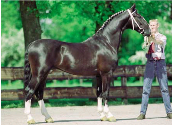
Nando (Fortissimo x Bayard x Wervelwind)

Marvel: this stallion is rarely used, but has indeed good results in sport and breeding. He can also be used with the aid of the Genebank."