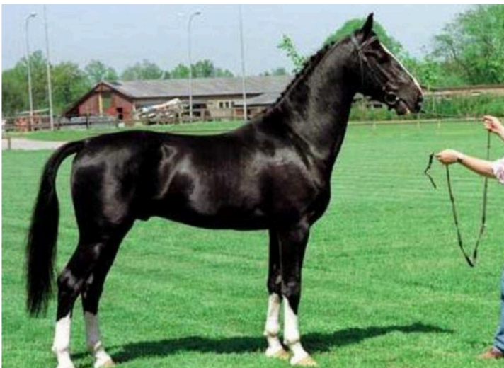
Heineke (Waterman x Pygmalion x Monarch)

GERRIT: "In the Netherlands we also have lowrelated mares that we may have considered 'too old fashioned' in the past, but which can now play a role in the fight against inbreeding. They could possibly be a future stallion mother. I am thinking of Heineke mares, for example. There will probably still be one here and there grazing under an apple tree, it seems smart to me to map that out. The fact that not all horses are registered may make it difficult to locate these mares, but there may be a breeder who has or knows such a mare and is reading this. Then I hope he will call the KWPN."