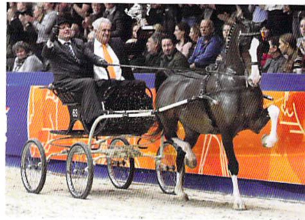
Icellie winning the Oregon trophy!

Delviro already won the Oregon Trophy in 2016 and was one of the favorites today. Ditsem, the champion of the stallion inspection in his vintage, also participated. Just like Dylano, who twice won the Manno Trophy. The youngest participant, Kane BF, made his debut this year in the Oregon Trophy.