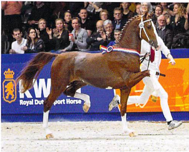
Macho van het Fledderbosch, stallion show champion