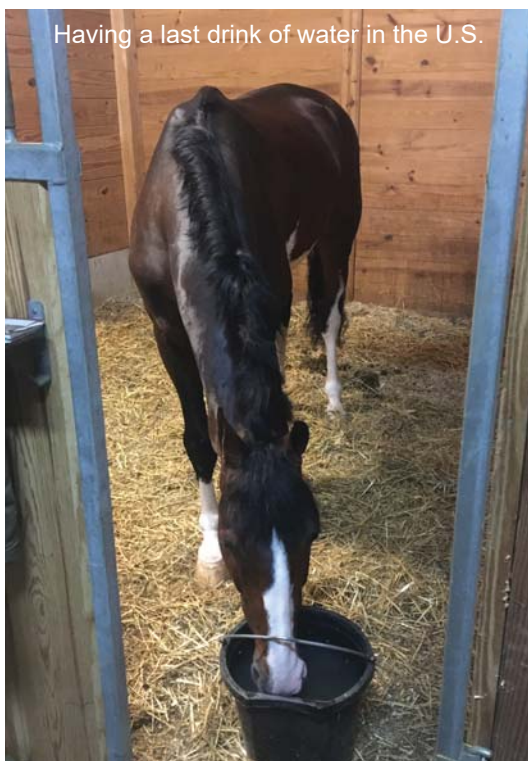
Having a last drink of water in the U.S.

In the USA left his mark on breeding, including several keuring champions and the licensed stallion Holland. In 2014 he was the North American champion in harness. 🍷