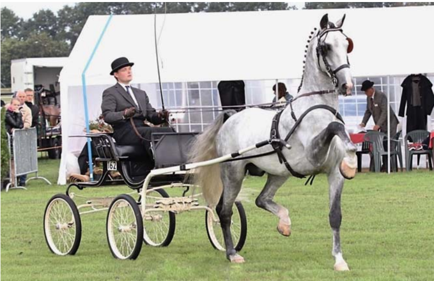
The KWPN stallion Idol has 45 points