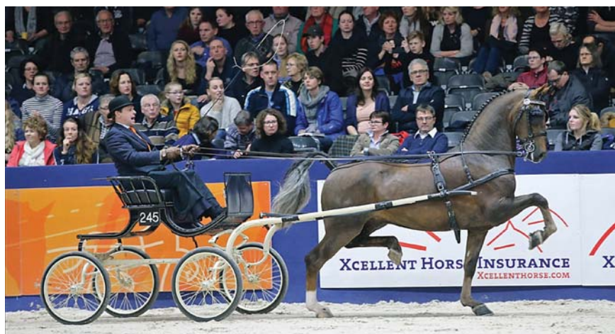
Ditsem always loves a fight, nothing is too much for him. Today he placed sixth.