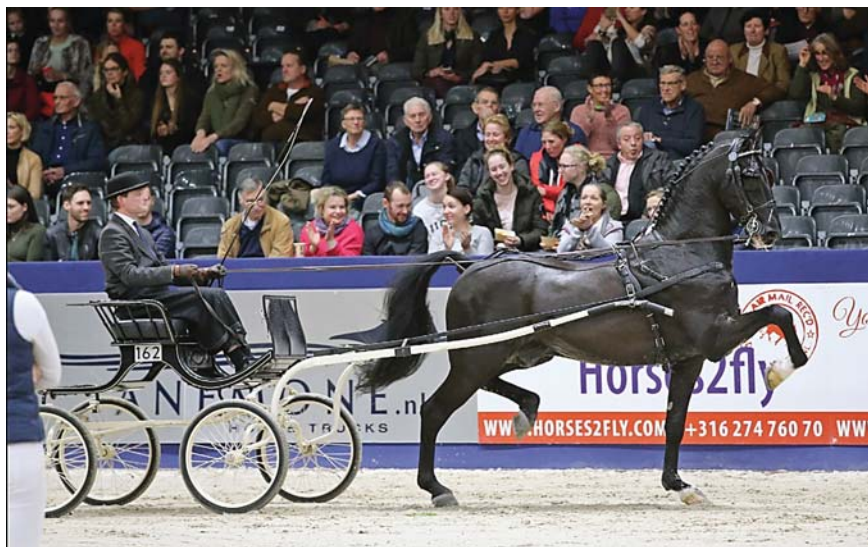
Dylano performed well in this clash of the titans and finished second.