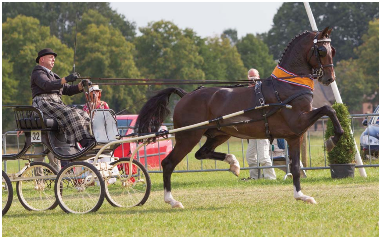
The keur stallion Cizandro heads the list of stallions with a reliability of 80% or higher