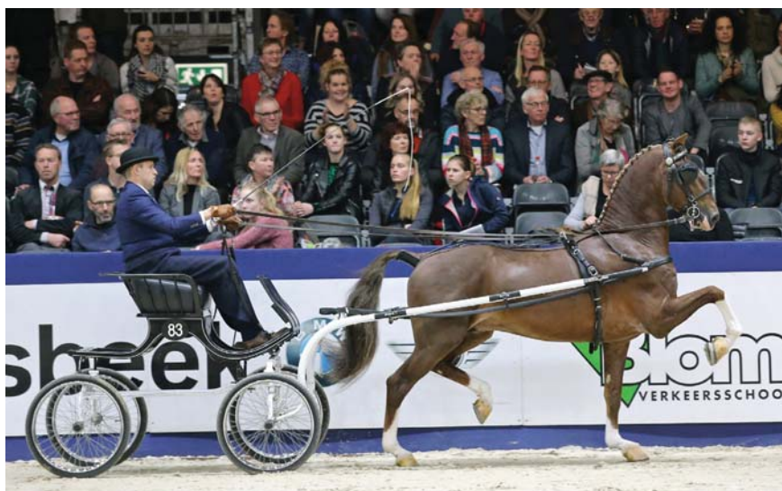
Indiana has the ability to grow during the competition, good for third.