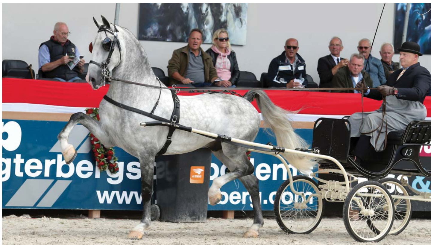
The breeding value of the Manno son Idol rose the fastest. The stallion was very successful in 2018. In the rankings for young stallions, this attractive gray is now in fourth place.