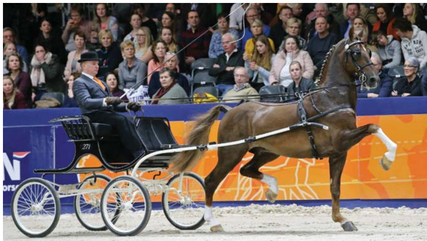
Heliotroop is a stallion that always shows a lot of talent. This time it was good for a fourth place