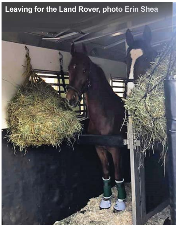
Leaving for the Land Rover

The KWPN-NA would like to sincerely thank all participants for being a part of this year's breed demonstration. Want to be a part of next year's event or see the action for yourself? Mark your calendars – the 2020 Land Rover Kentucky Three-Day Event will be held April 23-26! Go Dutch! 🇳🇱