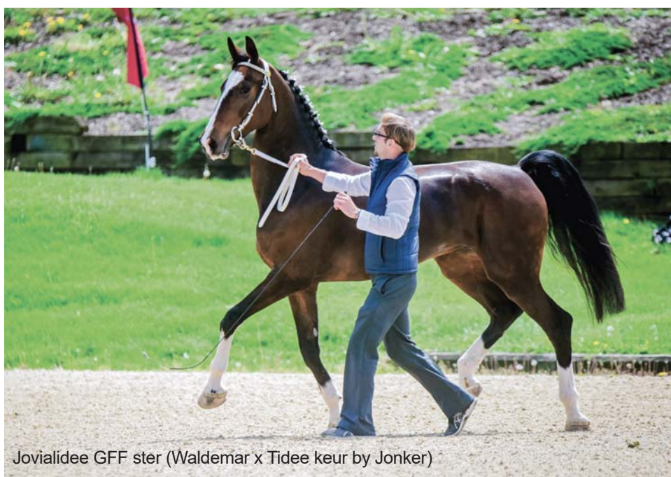
Jovialidee GFF ster (Waldemar x Tidee keur by Jonker)