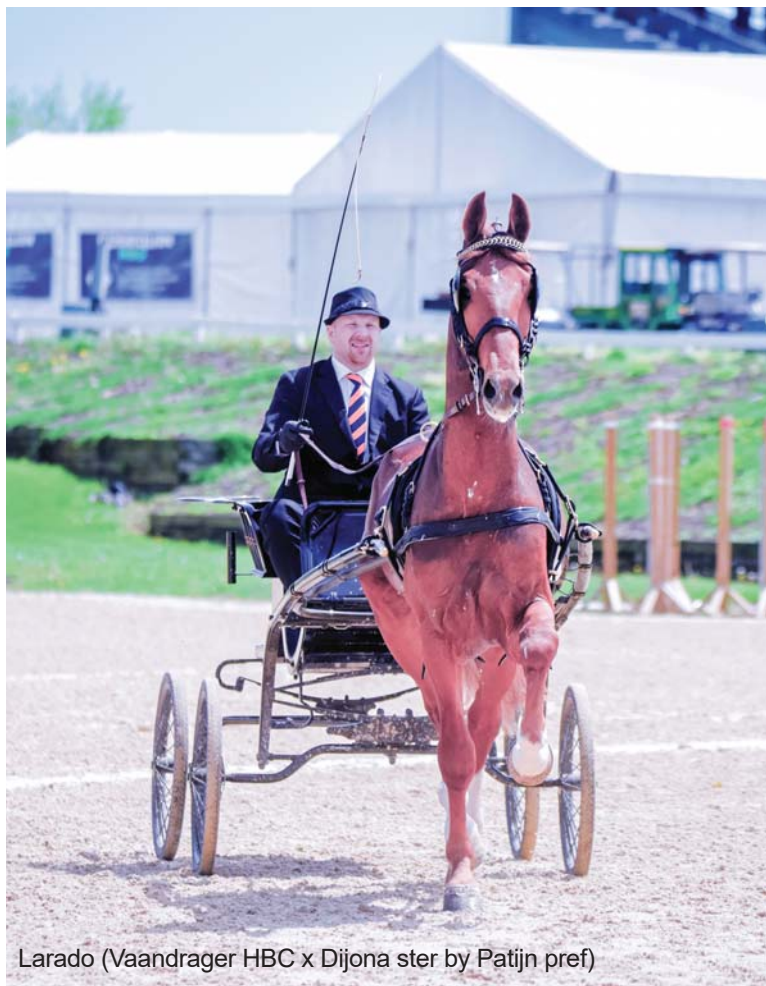
Larado (Vaandrager HBC x Dijona ster by Patijn pref)