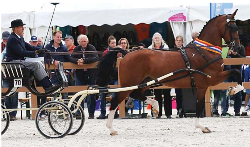
Elegant competed in honors and broodmare classes