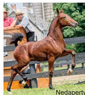
Nedaperty (Globetrotter x Edaperty keur by Unieko)