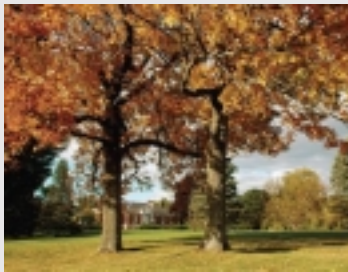
Pineland in autumn

The scores and remarks are given for a snapshot 'at this moment' in the lifetime of these horses. We encourage owners and breeders to attend keurings whenever possible for further evaluation of their horses, their breeding goals and breeding directions.