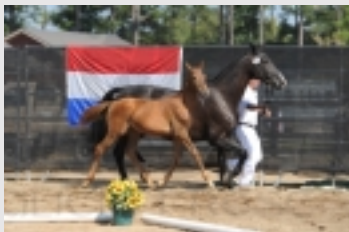
Folie a' Deux