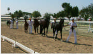
All hands on deck.

We are looking for photos of the horses at the keuring. If you have any, please send them to the Office . The photos for 'keuring results' can be low resolution. For horses in the Top Fives, please send photos that are a minimum of 300 dpi and 4" x 6" in size.