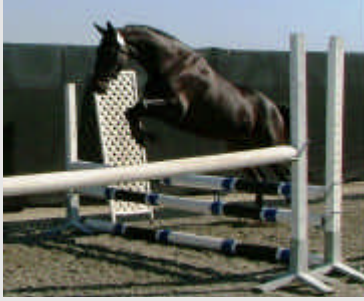
The jumping chute

The omission of the mare results is not an oversight. The dressage and hunter mares and missed the marks for star but all were entered into the studbook.