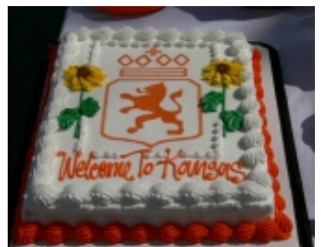
Welcome to Kansas; photo: Larry Childs