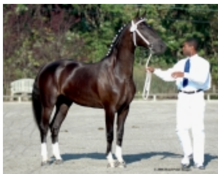
Willow WH