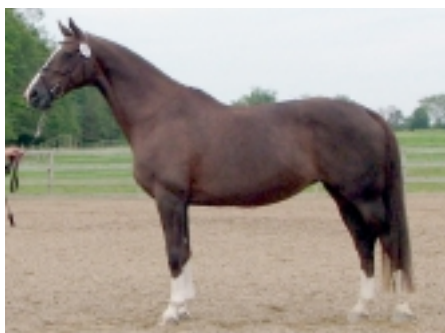
Miss Cleopatra, photo: Faith Fessenden

Highlighting this first stop of the 2006 tour was a very good quality foal class. Six out of twelve received 1st premiums.