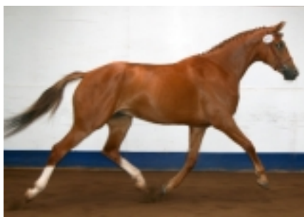
Wiando