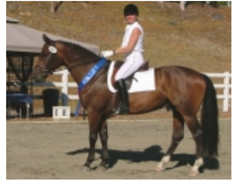
Virtuoso