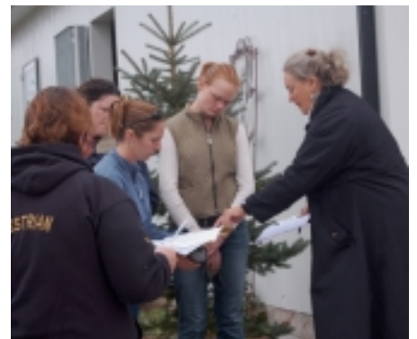
Faith