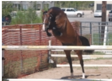
Upsadaisy