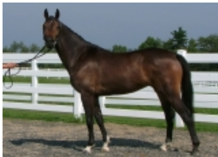
Zalanta