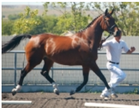
Ulette d' Malouin