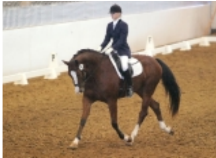
Uberlinus