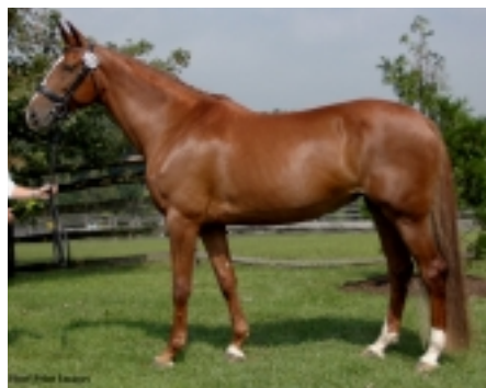
Paela, photo: Hoofprint Images

Unusual and exciting was the format of the foal class. A total of 27 entries were divided into 'sire-groups'. Not only was this extremely educational for the breeders and spectators, but it gave a preview of how the classes will look/feel in the future. Next year the foals will be entered as 'dressage' or 'jumper' foals thus there will be classes