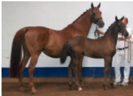
Bosanova NSN