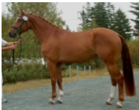
Versailles