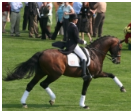
Anky van Grunsven and Krack C

through the centuries leading up the new millennium.