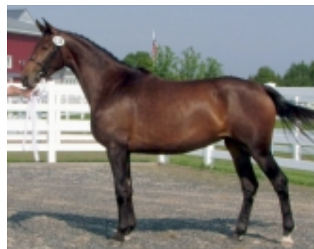
Writes SSF

A glorious day and a spectacular facility awaited us in Maine. Not a large number of entries but quality was high and we ran out of orange first-premium ribbons! Nine of the fifteen presented horses received 1st premium.