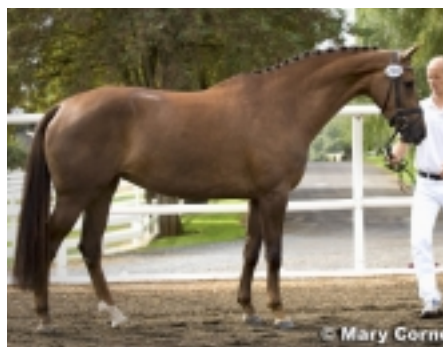
Verona