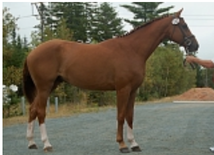
Wingar