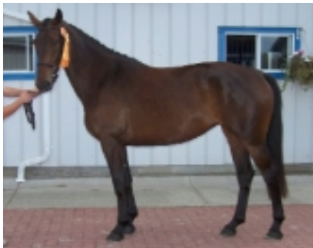
Wondar, photo: Lana Sneddon

Host Leanne Peniuk secured a good facility with safe stalls, good footing, and a lovely outdoor dressage ring for this keuring. The brisk temperature was needed to invigorate the jury after cancelled and postponed flights took their toll. But, as soon as the horses appeared all fatigue was forgotten as it does for everyone with the 'horse-bug'.