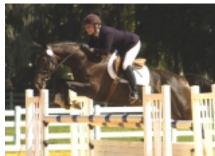
Ugot Swing Babe